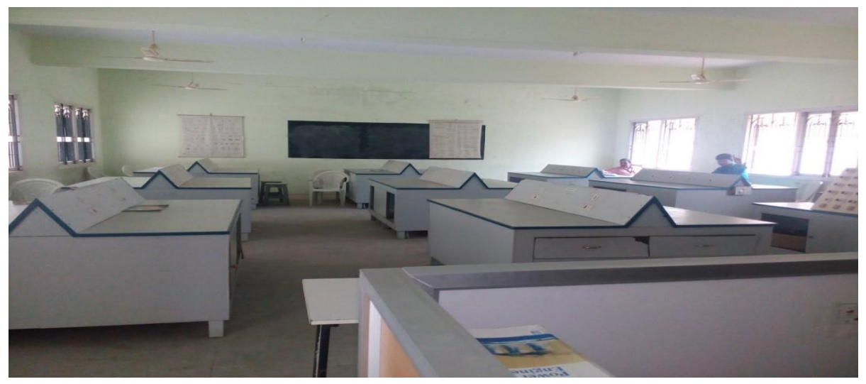
Area of the laboratory: 13.29M×9.12M=121.88Sq.M

Ph: 04567 - 222 234, Mobile: 94873 04000, 84893 04000, 87548 88877 | E-mail: office@syedengg.ac.in, saec@syedengg.ac.in | Web: www.syedengg.ac.in