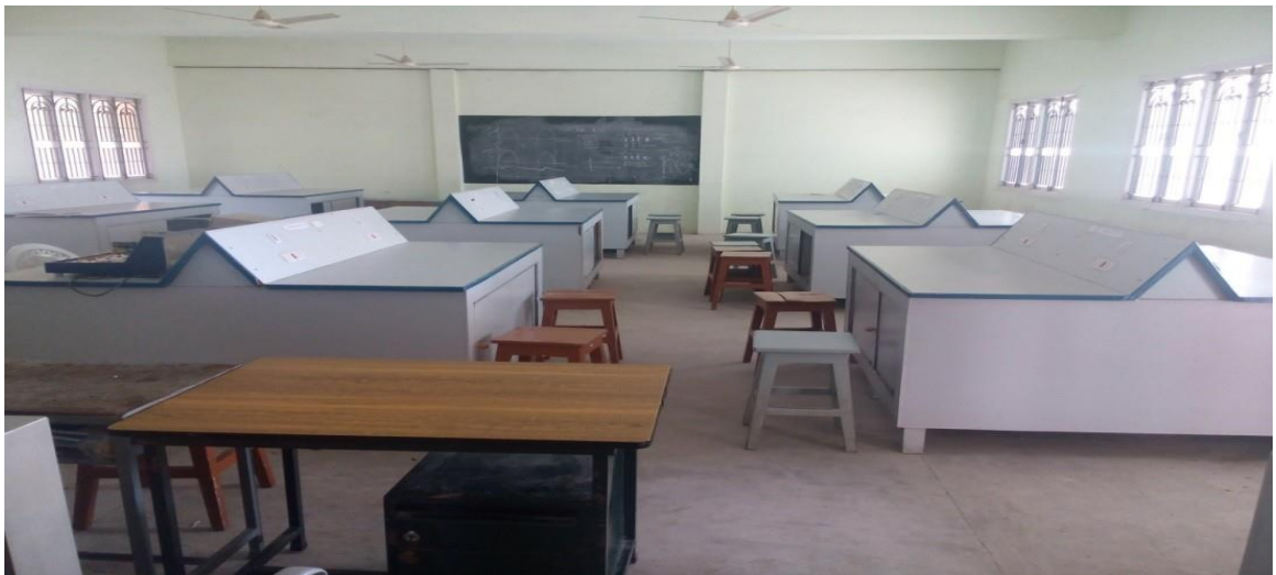
Area of the laboratory: 13.75M×9.12M=125.40 Sq.M